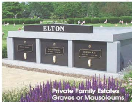
Private Family Estates Graves or Mausoleums