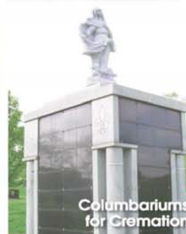
Columbariums for Cremation