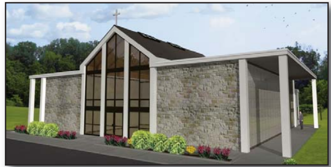
Holy Souls Chapel Mausoleum Holy Souls Cemetery, Coraopolis, PA

A general cleanup of all of our diocesan cemetery properties takes place each year during the month of March. Please remember that any objects left at the gravesites during the March cleanup will be removed. Thanks very much for your cooperation.