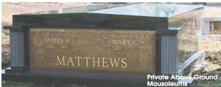
Private Above Ground Mausoleums