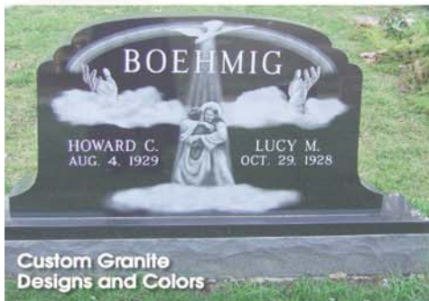
Custom Granite Designs and Colors