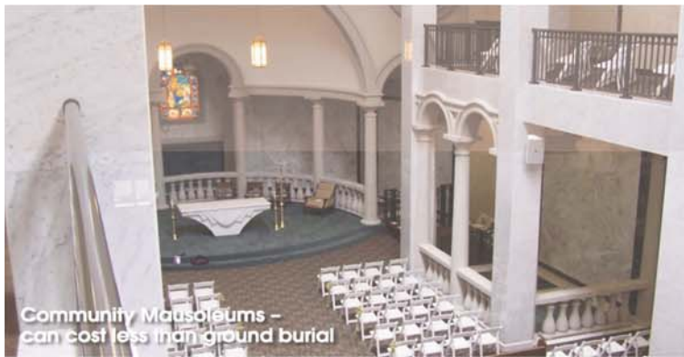
Community Mausoleums - can cost less than ground burial