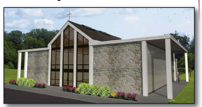
Holy Souls Chapel Mausoleum Holy Souls Cemetery, Coraopolis, PA

A general cleanup of all of our diocesan cemetery properties takes place each year during the month of March. Please remember that any objects left at the gravesites during the March cleanup will be removed. Thanks very much for your cooperation.